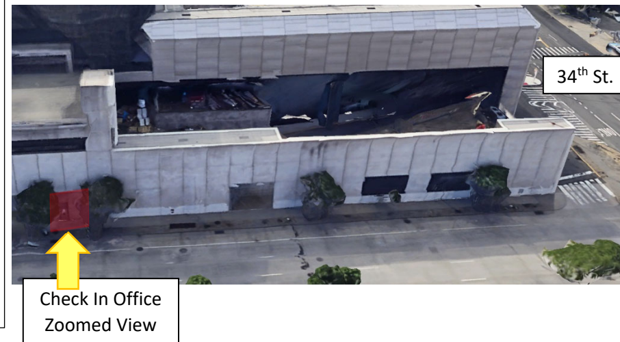
Check In Office Zoomed View

When you arrive at the Javits Center you will need to register your vehicle & driver at the Check-In Office (12 th Ave. approximately 1 block north of 34 th St.) where you will be issued a move-in or move-out pass. This pass will allow you access to the staging facility via the Truck Entrance. (just before 40 th Street on 12 th Avenue) Passes should be displayed printed side up on your dash above your steering wheel. You will not be permitted into the facility without this pass- No exceptions. Upon entry the driver will need to provide a valid driver's license to Public Safety. Once cleared by Public Safety you will be instructed by show staff on where and how you need to proceed.